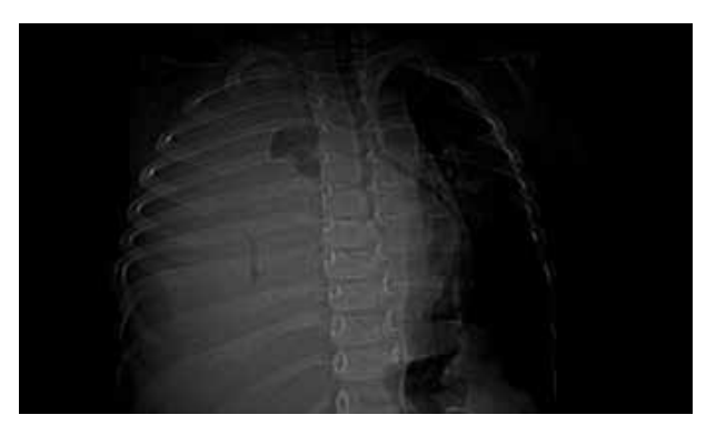
Figure 2. Scout view of the patient. Showing a massive effusion which has caused the mediastinum to shift to the left

imaging. Figures 1 and 2 illustrate the imaging results. Chest X-ray showed an opaque right thorax, with no other significant findings. CT scan revealed a nodular thickness of the pleura, with no mediastinal lymphadenopathy. After consultation from the surgical team, the patient underwent thoracotomy, and a biopsy was taken from the pleura. Macroscopic evaluation showed a cream tan mass with a heterogeneous cut surface. Microscopic evaluation showed a small cell malignant tumour, which consisted of monomorphic lymphoid cells with fine granular nuclear chromatin, with high mitotic rates and infiltration of the surrounding fat tissue and vascular structures with considerable necrosis. Immunohistochemistry resulted in the specimen staining positive for CD99, CD3, vimentin, and Ki67, while negative for CD20, CD34, CD79a, NSE, synaptophysin, and chromogranin. This was consistent with the diagnosis of acute lymphoblastic pre-T cell leukaemia. After the diagnosis was made, the patient received the BFM-NHL treatment protocol, which consisted of two months of induction protocol, 50 days of consolidation protocol, 50 days of re-induction protocol, and finally 24 months of maintenance therapy [1]. Figure 3 illustrates the CT results after treatment. The patient was followed up for three years, and in this interval, periodic clinical examinations and PET-scans have shown that he remains disease free.