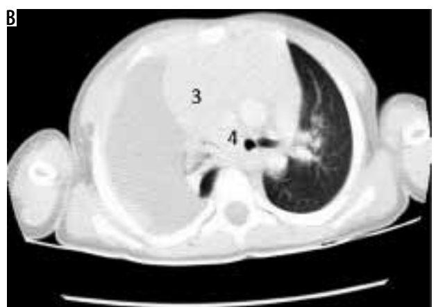
Figure 1. Initial computed tomography scan obtained from the patient. A) Mediastinal window, B) lung window. 1 — shows a diffuse right sided pleural thickening, 2 — shows a massive pleural effusion, 3 — shows the right lung which has collapsed because of the massive effusion, 4 — shows the shifting of the mediastinum to the other side